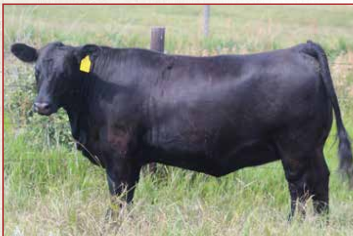
DAM OF LOT 41 MS RENOWN 134 ET

Heifer bull with extra carcass and maternal traits. 10 year-old dam has a great udder.