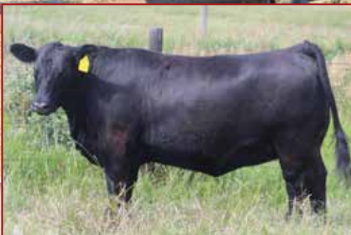
DAM OF LOTS 1-4 MS RENOWN 134 ET