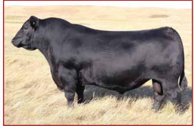
REFERENCE SIRE S A V CERTIFIED 0849