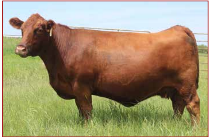
DAM OF LOTS 60-61 SIX MILE SIERA 655A

These two Captain sons come from our foundational Red Angus donor cow, Six Mile Sierra 655A. She has made a major mark on our herd as every Red Angus bull in this year's offering leads back to her. Her progeny are consistent in their depth, fleshing ability, maternal capability, udder quality, sound feet, and fertility. Captain adds a splash of calving ease and carcass merit to a quality cow line.