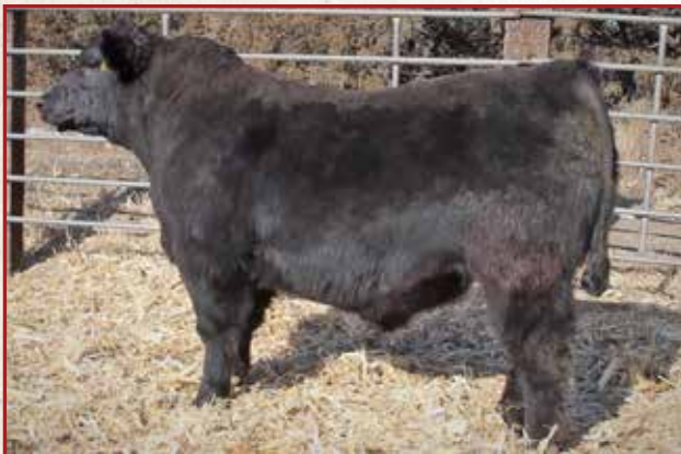
FLUSH BROTHER TO THE DAM OF LOTS 19-22 LEM GAME BREAKER 445