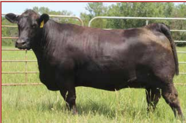
DAM OF LOTS 5-7 LEM MISS BRONC 923