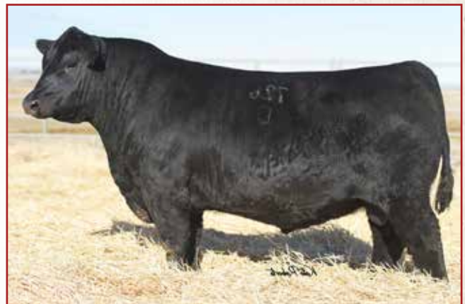
REFERENCE SIRE SITZ STELLAR 726D

Herd Bull! Long, deep, thick, and performance. Moderate birth with top performance traits and a good maternal pedigree.