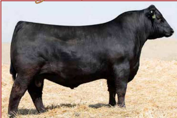
Sired by WERNER FLAT TOP • Owned with LOAN OAK CATTLE, IA