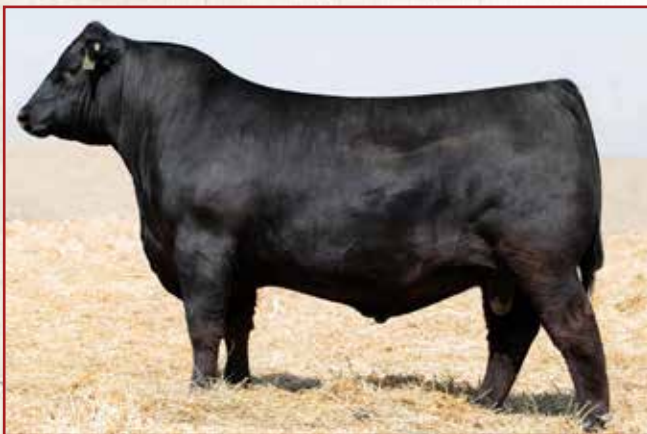
MATERNAL BROTHER TO LOT 24 LEM GLADIATOR 1039

Extra growth and carcass traits in this Bloodline son with Top 1% YW & MARB.