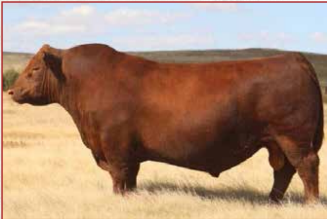
PATERNAL GRANDSIRE OF LOT 72 KJL/CLZB COMPLETE 7000E