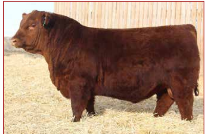
SIRE OF LOT 73 RED U2 TOWNSHIP 17G