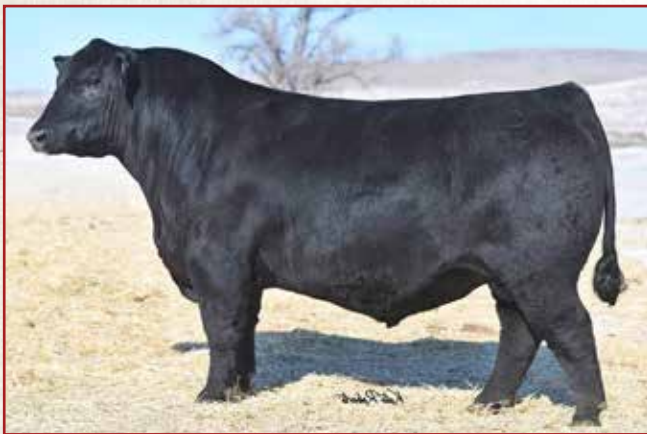
SIRE OF LOTS 42-45 SITZ RESILIENT 10208