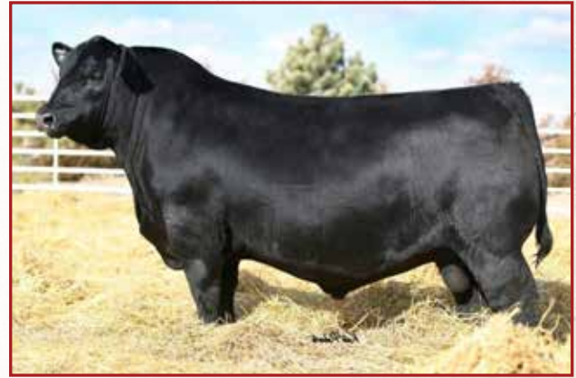
REFERENCE SIRE S A V DOUBLE WIDE 0861