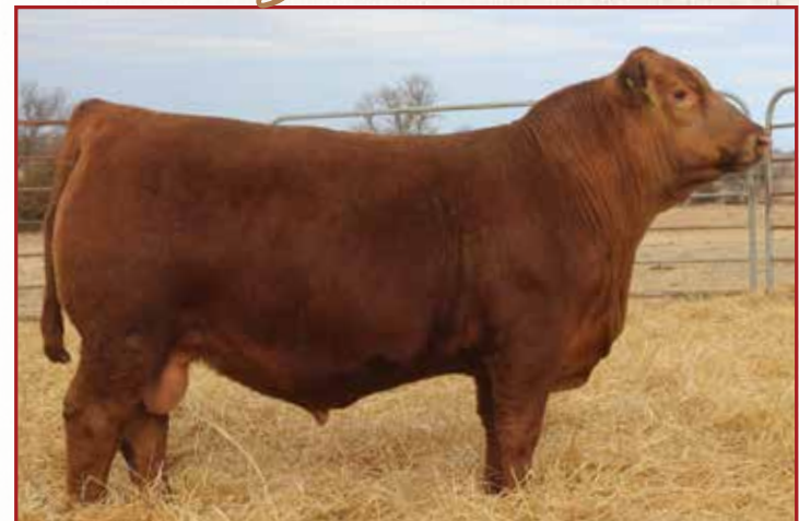
Sired by BIEBER CL STOCKMARKET E119 • Owned with ABS GLOBAL