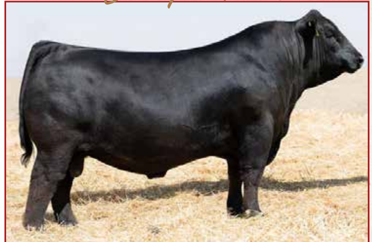
Sired by MUSGRAVE 316 EXCLUSIVE • Owned with LOAN OAK CATTLE, IA