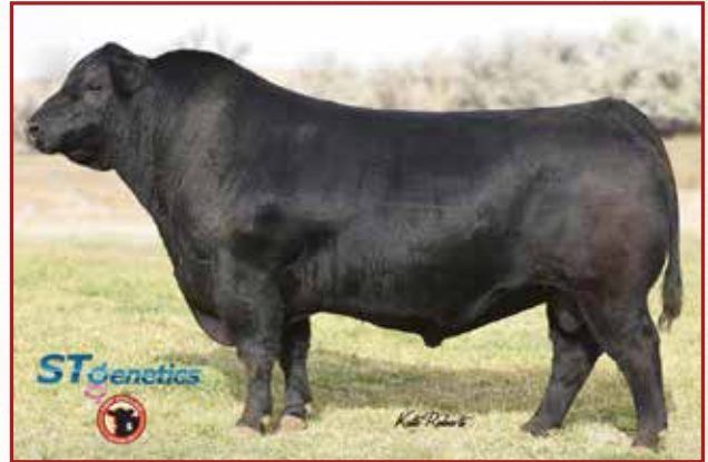
MATERNAL GRANDSIRE TO LOTS 47-48 MUSGRAVE 316 EXCLUSIVE