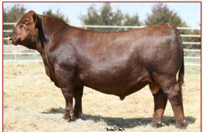
REFERENCE SIRE PIE LONG HAUL 1344

First PIE Long Haul son to sell and he is a good one. All the Long Haul's exhibit their sire's tremendous length and growth with great feet and legs. We think Long Haul's best contribution will be the outstanding females he is already producing. Our breeding season was nearly over when we purchased Long Haul in 2022, so look for many more sons in the coming years.