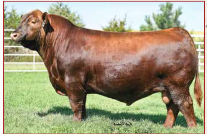
REFERENCE SIRE PIE CAPTAIN 057