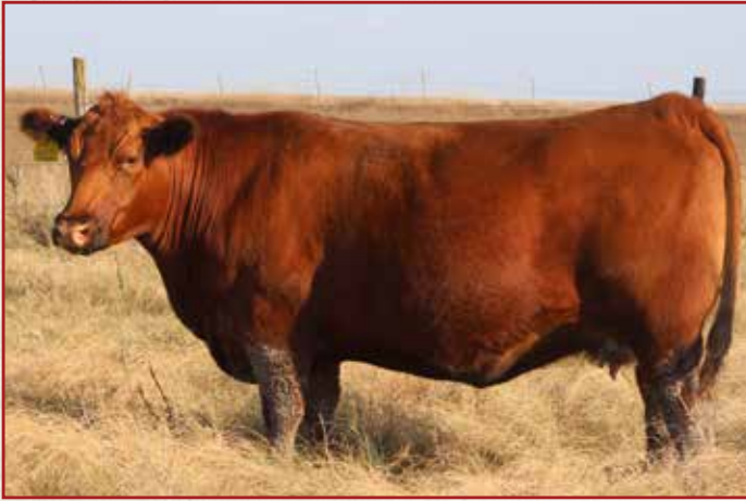
DAM OF LOTS 52-56 LEM MS SENECA 902 ET