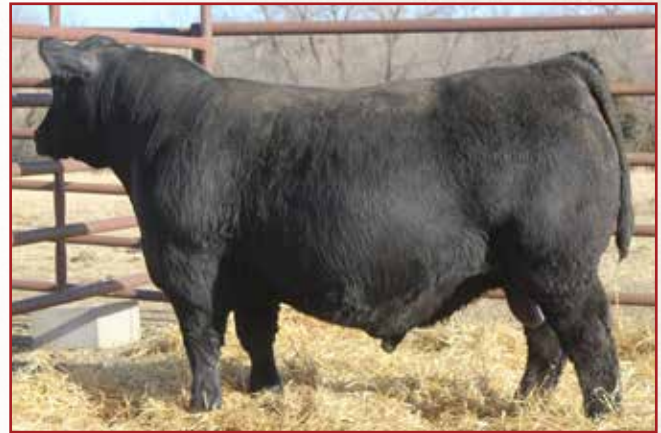
FULL BROTHER TO THE DAM OF LOTS 1-4 LEM Bodyguard 1032 ET Selected by Leo Gauderman

Good, powerful calf with 12 of his 17 EPDs in the top 35% of the breed or better. Every calf from this flush has met our standard and will do great things.