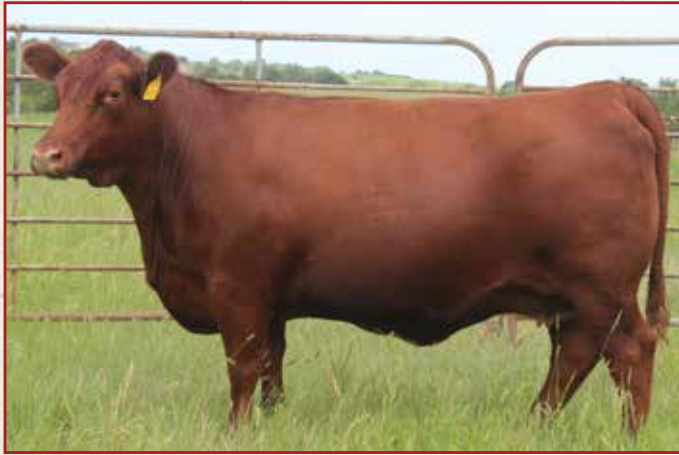
DAM OF LOT 72 LEM ONEKIND 934 ET