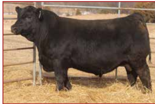
MATERNAL BROTHER TO LOT 31 LEM REVIVAL 2049