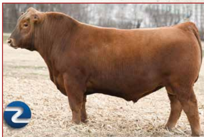
MATERNAL BROTHER OF LOTS 52-56 LEM WORLDWIDE 1001 ET