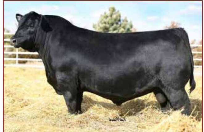
REFERENCE SIRE S A V DOUBLE WIDE 0861