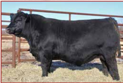
MATERNAL BROTHER TO LOT 31 LEM DEEP IMPACT 0404