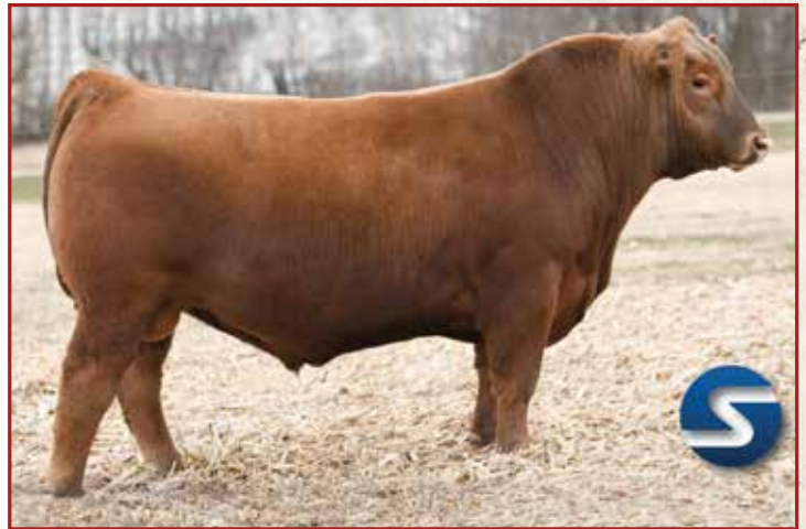
Sired by PELTON WIDELOAD 78 • Owned by GALL FAMILY RED ANGUS, SD