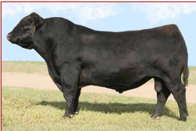
SIRE OF LOT 75 TAU Infinity 47C

Stellar son with calving ease, performance, and style. Clean made and walks like a cat.