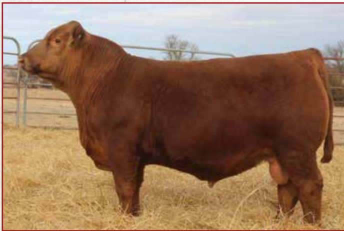
MATERNAL BROTHER TO THE DAM OF LOT 57 LEM STOCKYARD 2001 ET