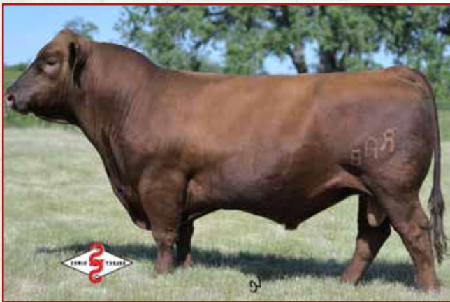
REFERENCE SIRE BIEBER CL STOCK MARKET E119