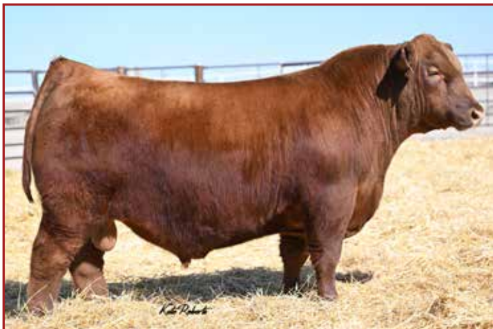
Sired by PELTON WIDELOAD 78 • Owned with DK RED ANGUS, ND