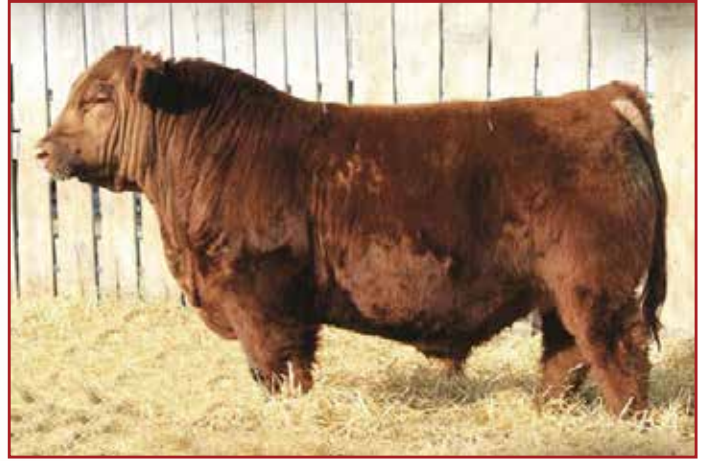
SIRE OF LOTS 52-56 RED MRLA RESOURCE 137E