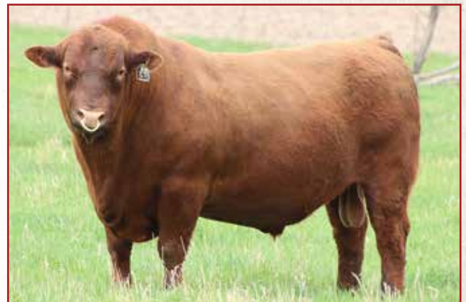
SIRE OF LOT 70 PIE CINCH 4126