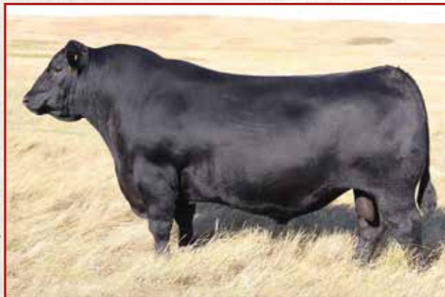
REFERENCE SIRE S A V CERTIFIED 0849

Double Wide son with lots of performance and out of a very attractive, great uddered cow.